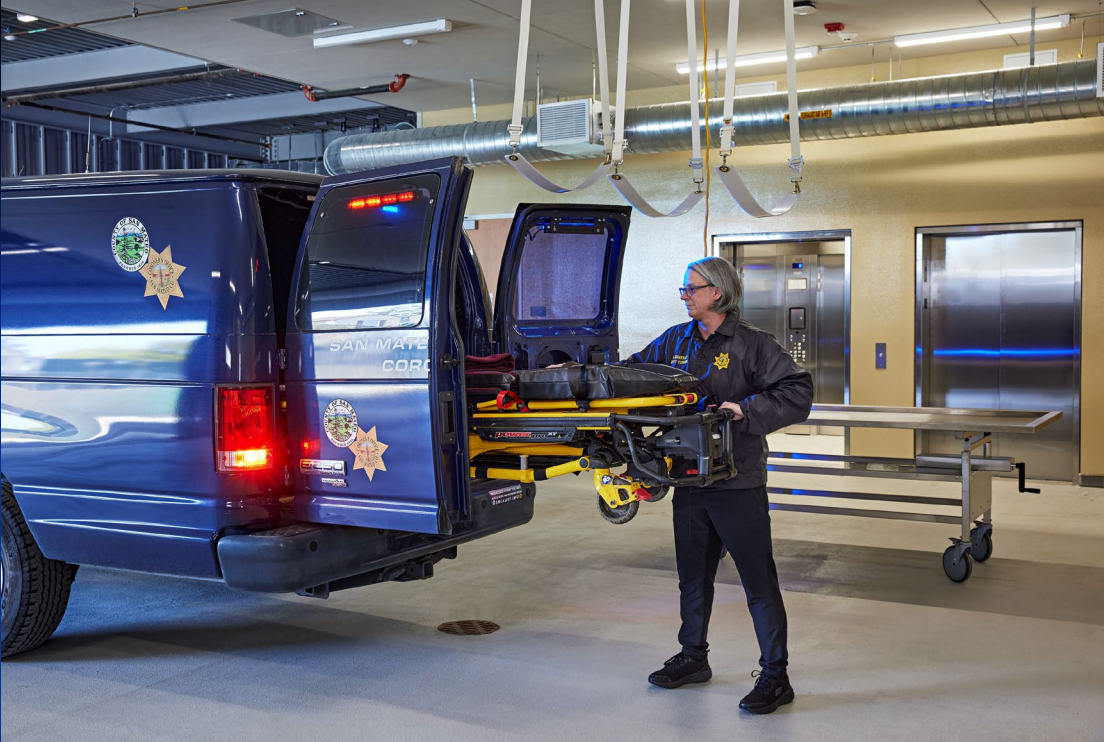
Secured Sally Port