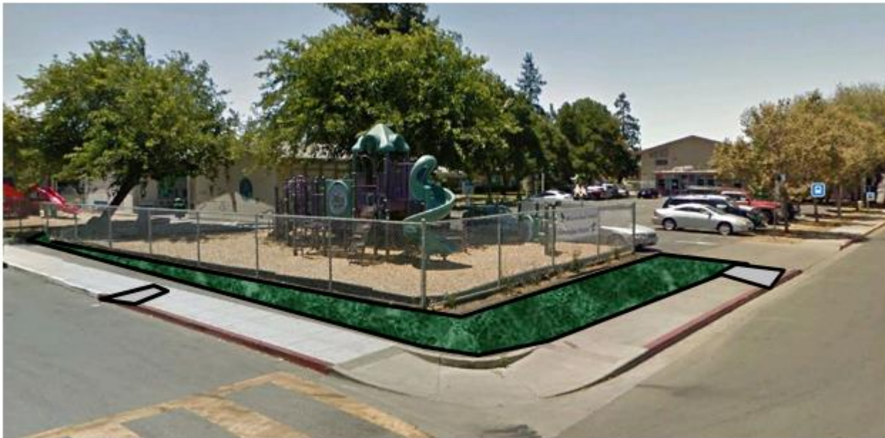
Planned improvements at Fair Oaks Ave and Oakside Ave